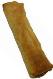
Plain Sausage Roll