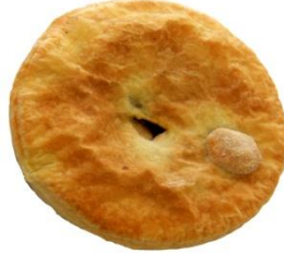
Tomato, Onion & Cheese Pie 260g only Pastry Circle