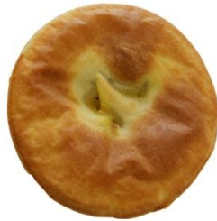
Mince 200g only ^