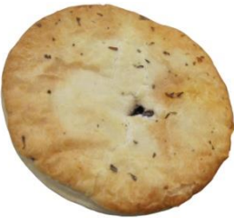
Lamb & Herb 260g only Herb