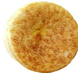
Chicken & Vegetable Pie Sesame Seeds