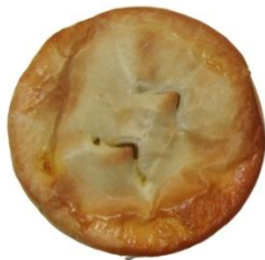
Chicken Curry 260g only >>