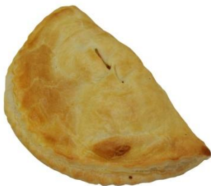
Vegetable Pastie II