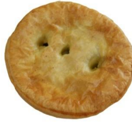
Beef & Pea Pie 260g only III