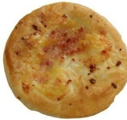
Beef, Bacon & Cheese Pie Cheese & Bacon