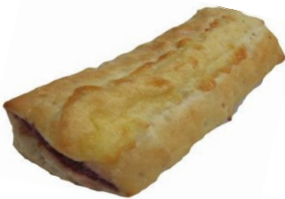
Kabana & Cheese Roll Cheese