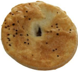
Beef Pepper Pie Cracked Pepper