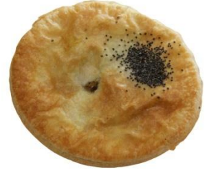
Beef & Mushroom Pie Poppy Seed