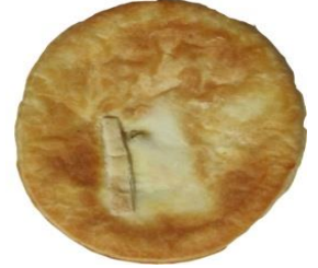
Chicken Mornay Pie 200g only Pastry Strip