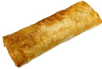
Chunky Vegetable Roll Sesame Seeds – Filling Vegetable