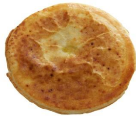
Vegie Pie 260g only Parmesan Cheese